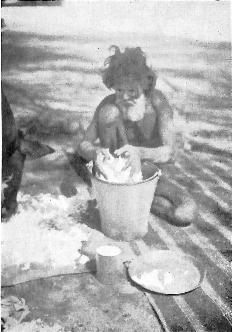
Maharaj prepares feed for a cow.