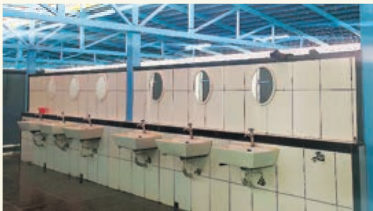
New sinks installed in Hostel D

Although the Trust cannot accept foreign donations at this time, we encourage Trustwallas and Meher Baba organizations to continue to collect the love offerings from Baba lovers and to keep the funds on account until such time that we will be able to accept them.