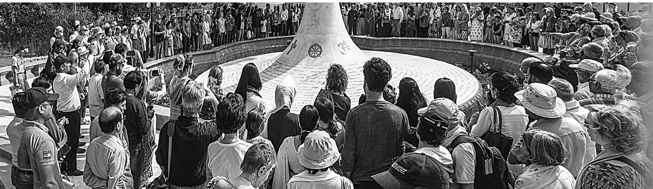
Inlaid mosaic Buddhist wheel symbol on the base of the Tower (below)