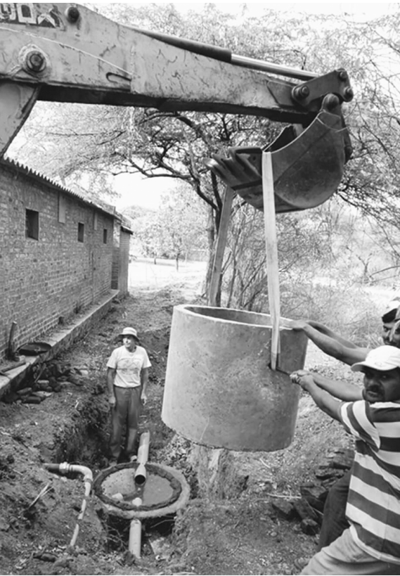
A new sewer pipeline was constructed at the MPC replacing the aging 40-year-old system

continue. Ongoing medical care is one of the major ways the Trust helps the local community. In order to safeguard doctors, nurses, and patients, special precautions have been instituted during this pandemic: markers for each patient to stand six feet away from each other while they are waiting to be seen; partitions to keep some separation between each patient and the doctor seeing them; and masks and gloves being utilized to protect the healthcare providers and patients.