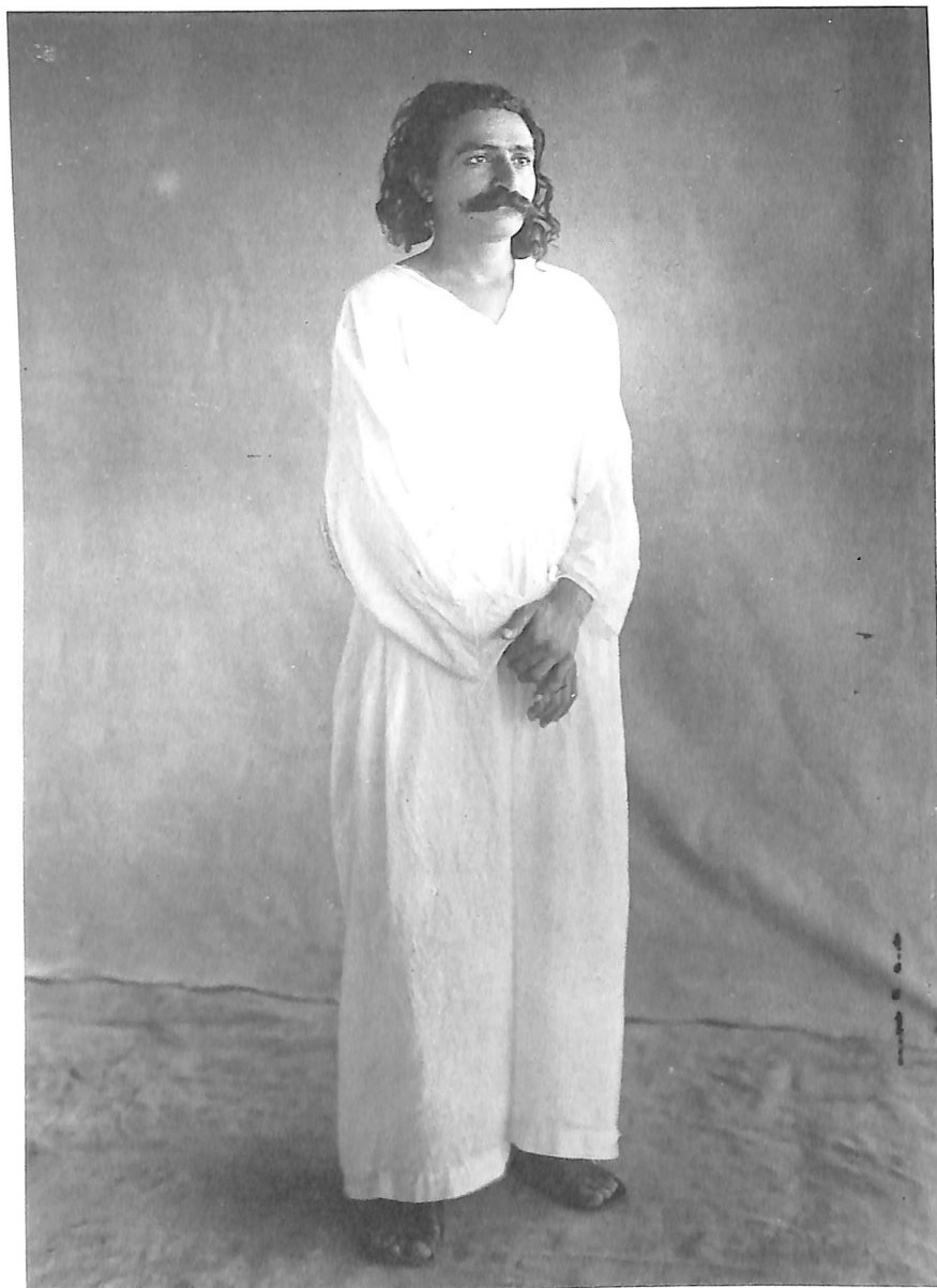
Meher Baba — Ahmednagar, India 1927

"I have come to sow the seed of love in your hearts so that in spite of all superficial diversity which your life in illusion must experience and endure, the feeling of Oneness through love is brought about amongst all nations, creeds, sects and castes of the world."