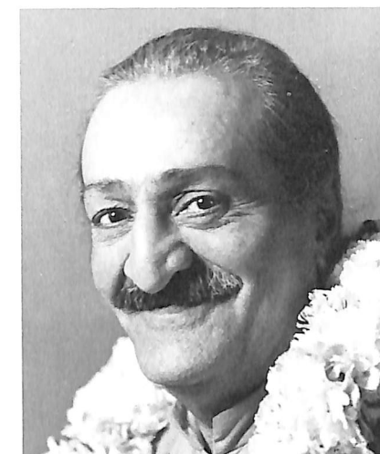
Meher Baba — Washington, D.C. 1956