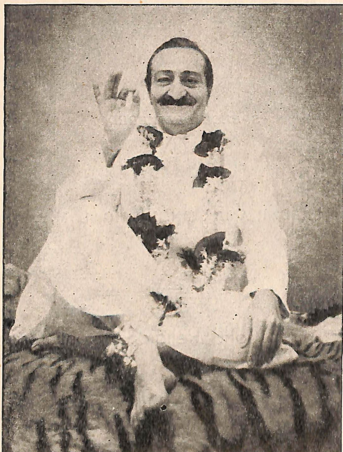
AVATAR MEHER BABA