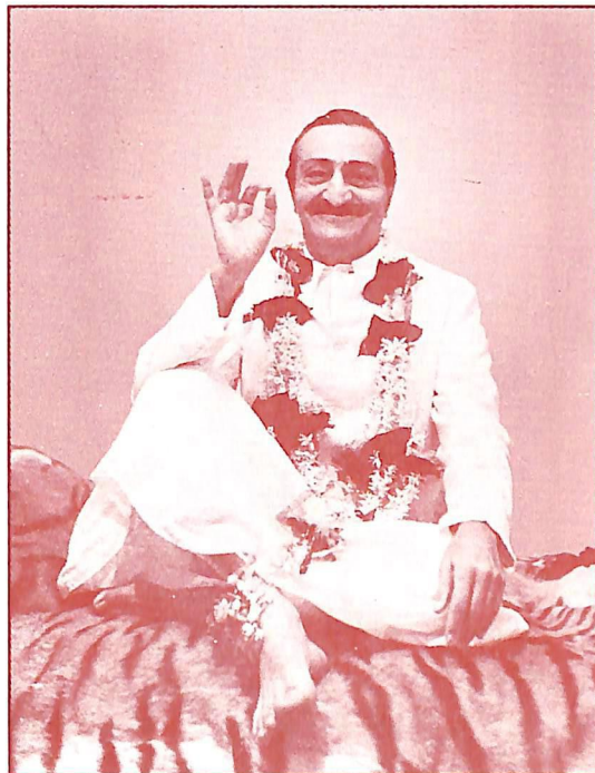
AVATAR MEHER BABA