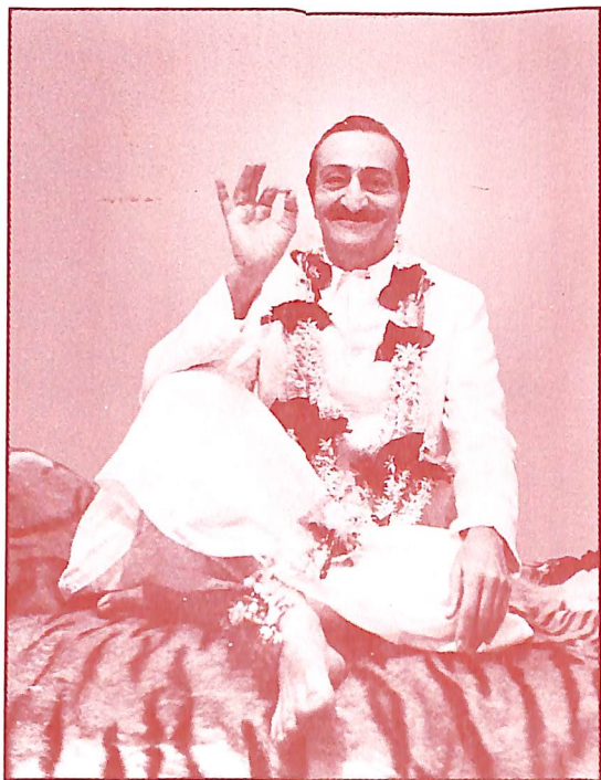
AVATAR MEHER BABA