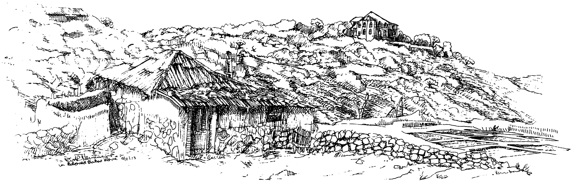
Mahabaleshwar. The large building in the background is the Rippon Hotel. In the foreground is the small house where Meher Baba in 1946 spent time in seclusion and also worked with a number of masts. Meher Baba stayed at the small town on the crest of the Western Ghats many times, including a 100-day seclusion in 1951 during the New Life period.