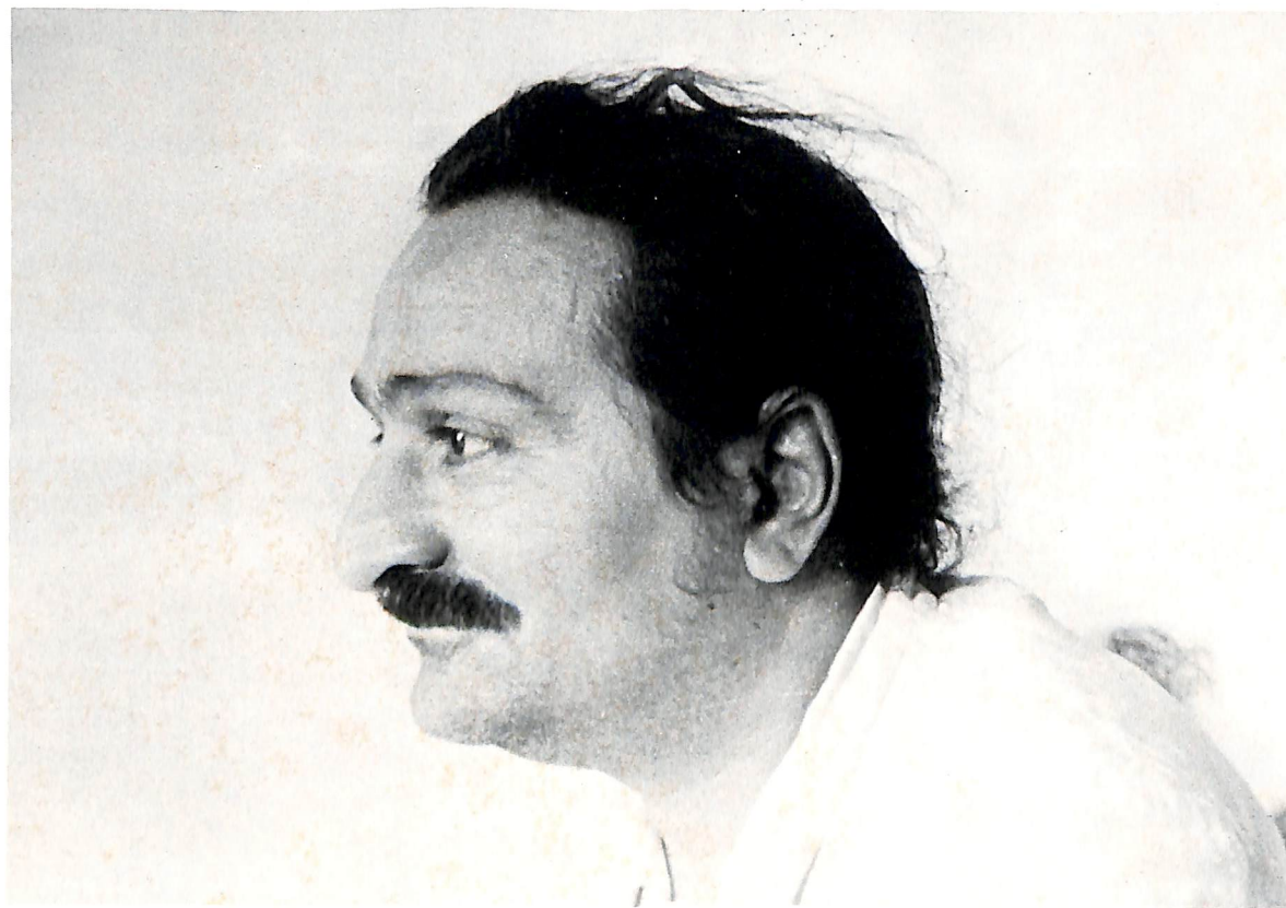
Avatar Meher Baba