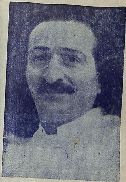
Avatar Meher Baba