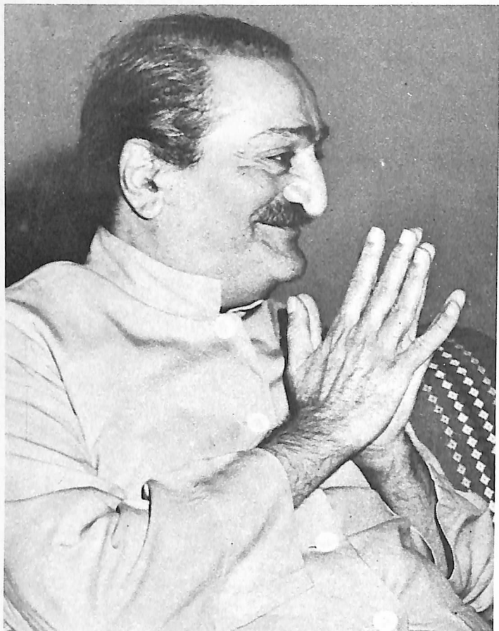
Bombay, December 1957

I give you all my blessing that the spark of my divine love may implant in your hearts the deep longing for the love of God.