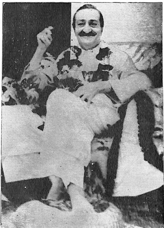
AVATAR MEHER BABA

"The Universe is my ashram, and every heart is my house, but I manifest only in those hearts in which all other than me, ceases to live".