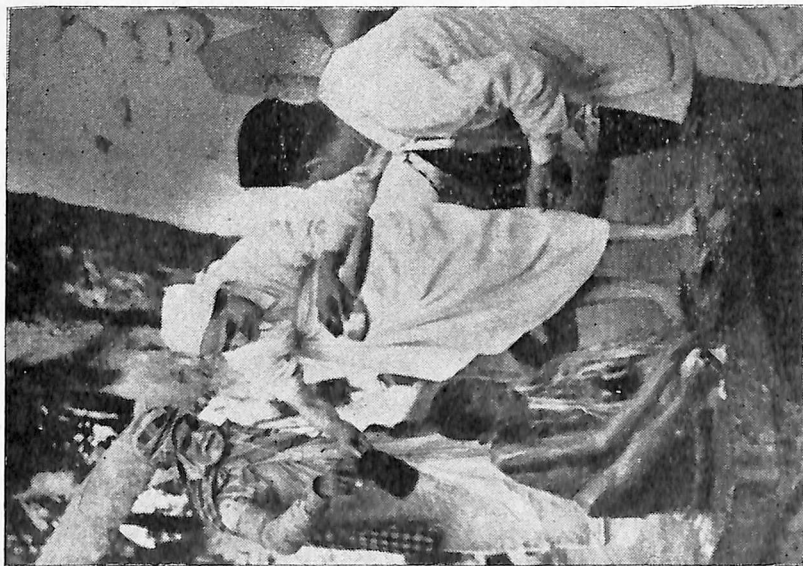
Meher Baba bathing lepers at Pandharpur. On His right is Gadge Maharaj.