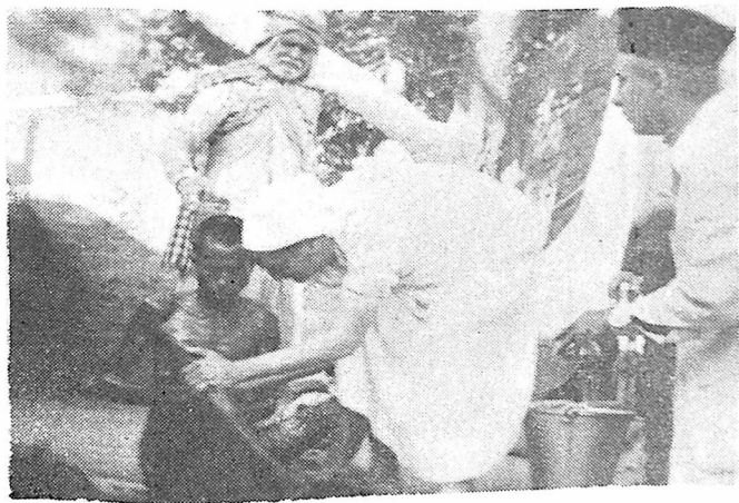
BABA washing the laper at Pandharpur in 1954