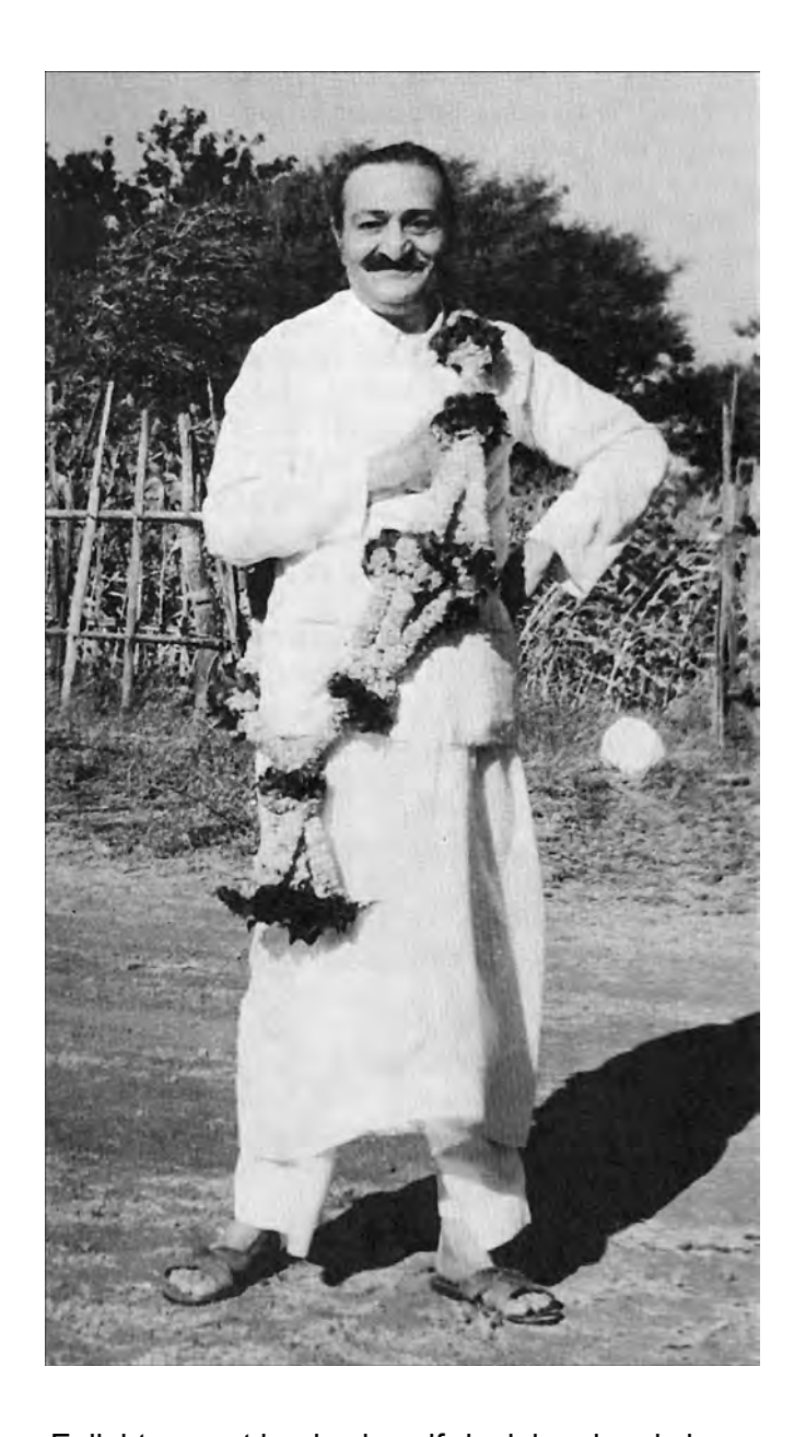
Enlightenment hegins in self-denial and ends in self-revelation

Self-denial is arduous, forced, and self-forgetfulness is easy and natural. Self-denial would be the quicker way if it could be done,