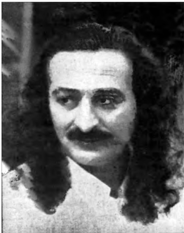
SHRI MEHER BABA