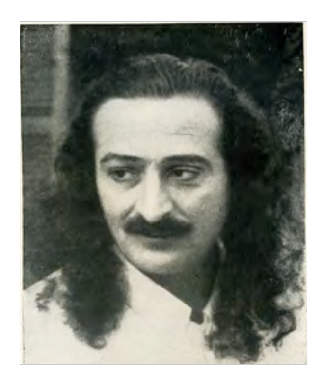
SHRI MEHER BABA