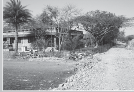
Although much effort has The new access road turns away from the Approach Road, crosses farmers' fields, and then abruptly turns again toward

battle involving unrelenting political pressure and vehement farmers' demands for a road to Pimpalgaon-Malvi village, verging directly from Meherazad's private Approach Road. been made to explain to Meherazad.