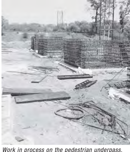
Ten concrete sections are fabricated on site first. When they are ready, the railway line will be closed, and in a few hours workers will exca-

The Trust's plan for the area below the rail- vate below the track and insert the concrete way line is for an historic park, landscaped to highlight the sites of the former Post Office, the Hazrat Babajan School, and the Sai Darbar, important buildings in Baba's