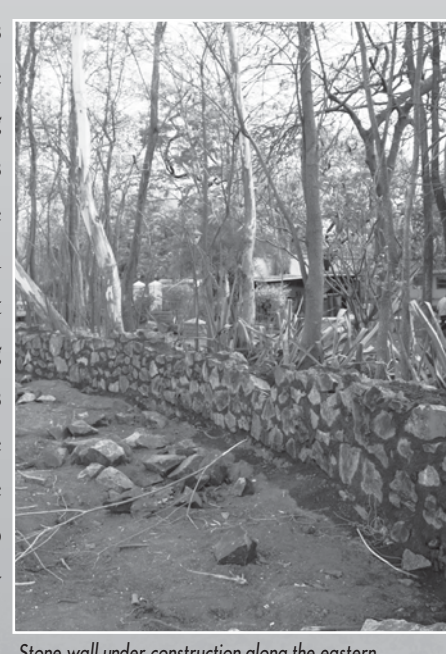
ne wall under construction along the eastern

The work is not over, and the Trust is still hoping to find some means to overcome the current situation completely. What the future will bring is in Baba's hands as always, but we continue to pursue every avenue to reverse this travesty of justice and to prevent the dese- boundary of Meherazad