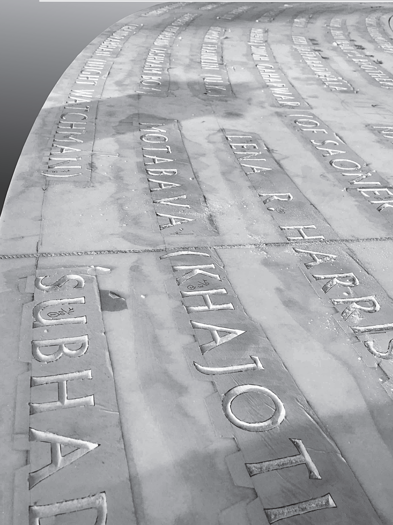
The names are carved in circles around the marble base of the tower.

The final stages of work on the Memorial Tower are going on now. As per Beloved Baba's instructions for the Tower, the carving of 353 names has been done, from December 2018 to March of this year. Baba stated in His message for the foundation ceremony of the Memorial Tower in December 1944: "There are also others . . . who served My Cause with unimpeachable integrity of character before dropping their physical bodies. For each one of them a separate flower is placed in the foundation of the Tower, and the names of all of them will be inscribed on the Tower of Glory which will be erected on this foundation."