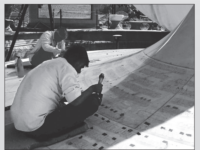
The carving has been done by specialist stone carvers from Rajasthan.