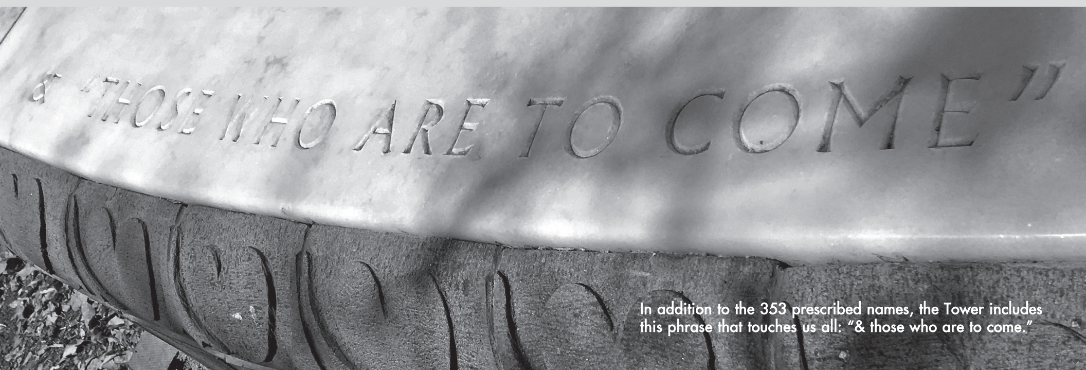
In addition to the 353 prescribed names, the Tower includes this phrase that touches us all: "& those who are to come."