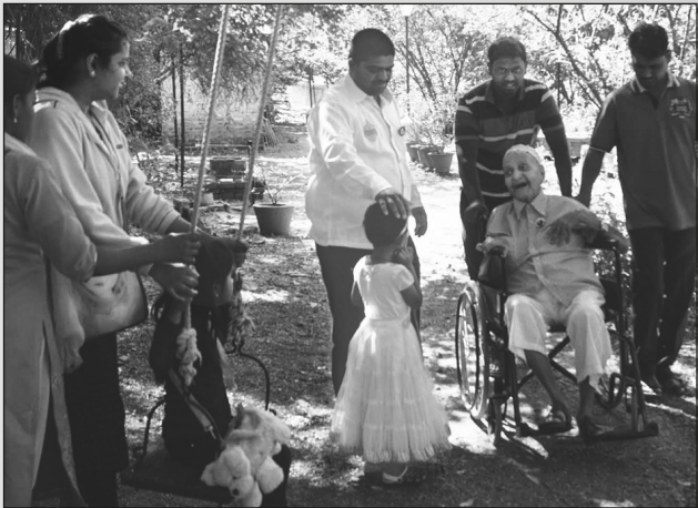
Baba lovers enjoy Baba’s atmosphere in the garden at Meherazad

As Baba lovers have often mentioned, stepping inside the gates of Meherazad into its timeless atmosphere brings a palpable feeling of intimacy with Baba, of being in His presence. Meherazad is a place where every grain of sand has been impregnated with His physical footprint, every path and walkway is a reminder that He is just around the corner, and each room is enlivened by the fragrance of the daily life He led with His mandali. And so the task of preserving Baba’s home for future generations holds deep meaning and inspiration in our hearts.