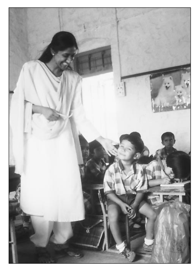
A class in the Meher English School, most of whose 287 students in kindergarten through the tenth standard hail from Arangaon, the village on the south border of the Trust Estate.

Another major Trust activity in the educational sphere is the Meher English School, which this past April completed the thirteenth year of operations from its site in the Education Building on the southeast border of the Trust Estate near Arangaon.