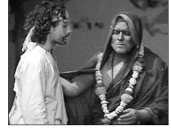
Baba and Upasni in the birthday play

Emperor of vogis, Master Upasni sends his salutations to you from afar; Formless, non-dual, without attributes, O Master, You are Avatar!