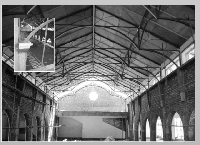
Dining Hall roof with inset of steel-truss detail. Dining Hall will display murals by