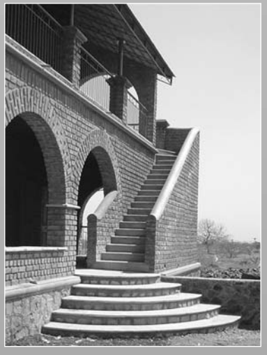
Bedroom wing veranda and steps into the courtyard.