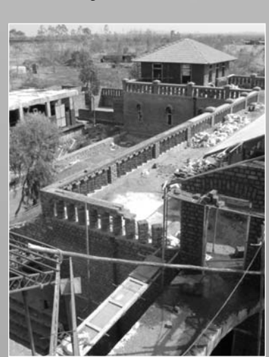
Dining Hall Terrace and (top of photo) Music Room, a cabin like the Rahuri Cabin for musical rehearsals