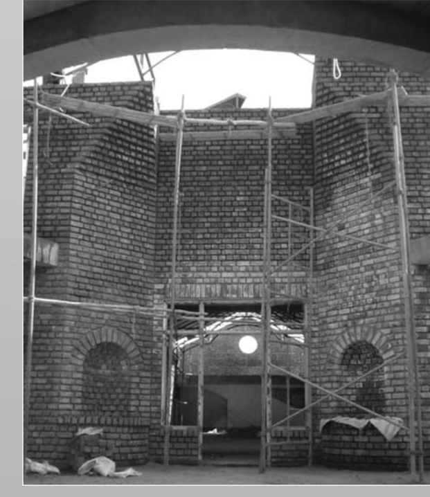
Entry foyer to the dining hall. The corbel arches and Retreat. The central panel above the door to the dining hall will display a painting by Charlie Mills