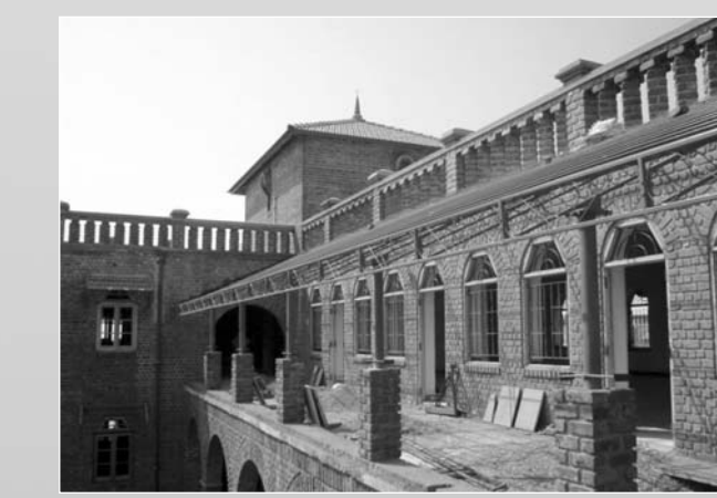
Top floor of the administrative wing.