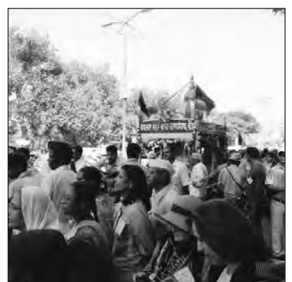
The New Life Padyatra procession with its decorated cart.

Avatar Meher Baba Ahmednagar Centre members, Meherabad residents, and pilgrims from Baba centers around Maharashtra, from the USA, UK, and Iran. There were many children of all ages and a number of elderly people! The four-hour journey culminated in a walk through Arangaon village and up the Hill to Baba's Samadhi, followed by a picnic lunch.