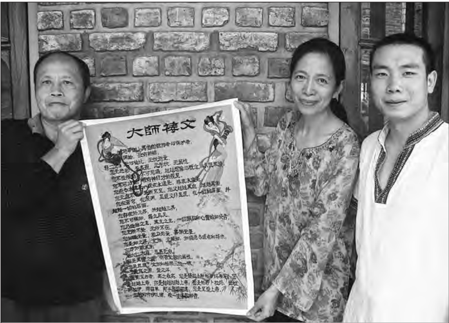
One pilgrim presented this gift—Meher Baba’s “Master’s Prayer” in beautiful Chinese calligraphy—which he had made.

This year in August a group of thirty-one Chinese pilgrims came to Meherabad. Most of them were connected to each other through meditation. Their meditation teacher presented a practice based on the