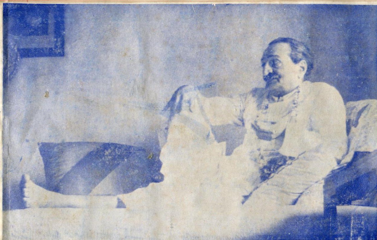
AVATAR MEHER BABA