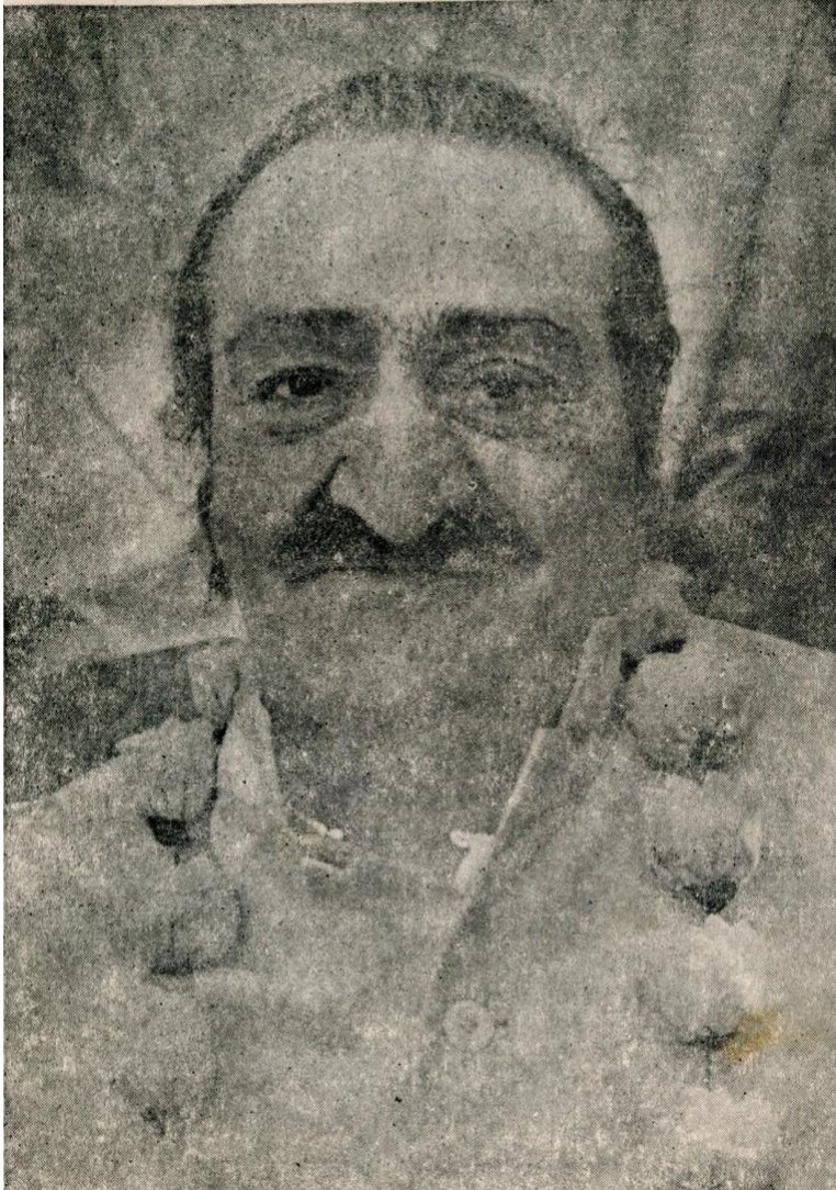
AVATAR MEHER BABA