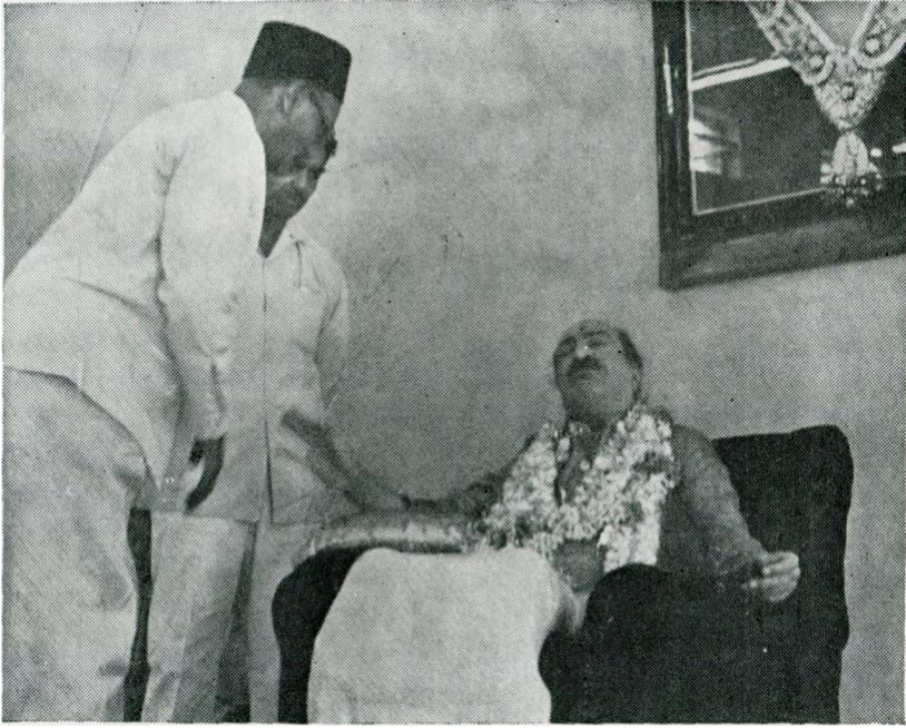
Beloved Baba in ecstatic mood as Dr. C. D. Deshmukh approaches Him with a request to touch the Bronze-Bust, on the occasion of His opening of "Poona Centre Avatar Meher Baba Hall" on 1st May '64.